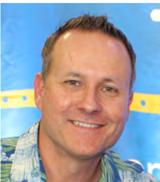
Scotty B Monday - Friday 10 AM to 3 PM