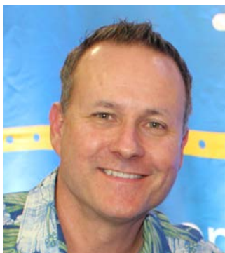
Scotty B Monday - Friday 10 AM to 3 PM